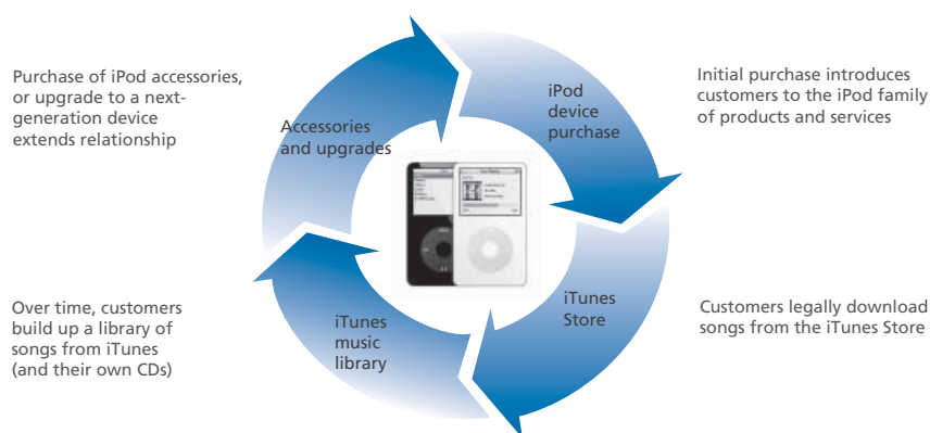
Exhibit 2 Apple's integrated business design has created a self-reinforcing cycle for its customers and high barriers to entry for its competitors

Research In Motion launched the BlackBerry in North America in 1998. In contrast to the Palm TREO, its only true competitor at the time, the BlackBerry had a scroll wheel and a QWERTY typewriter keyboard. More important to its target corporate customers, the BlackBerry